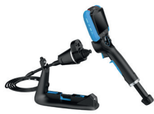
Quickly exchangeable probes with different diameters and working lengths