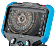
5.5" OLED touch display